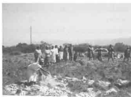
Figure 5. A farmer demonstrating a trial on a small portion of land.

I always thought that the issue of experimentation and designing of trials was a mammoth and complicated task and was the sole work of researchers. But having