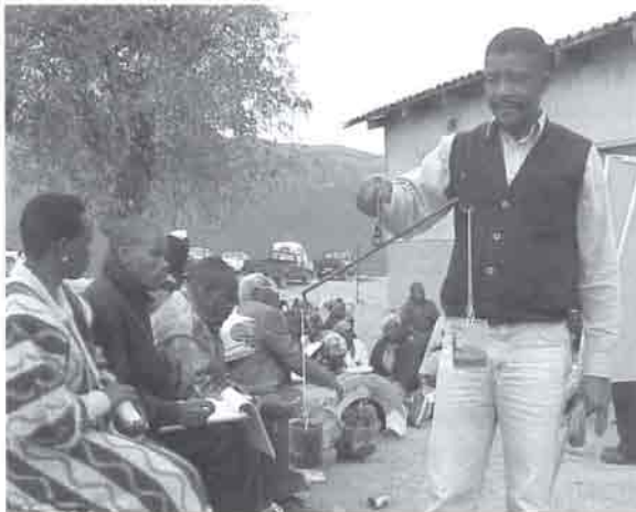
Figure 2. Level scale for demonstrating the water-retaining capacity of the soils.

After getting the results, the research team used guidelines from Borman et al. (1989) to rate the levels of essential elements and suggest different options for improvement. To simplify the presentation of the scientific information to farmers, the team developed several tools. They made colour posters illustrating the symptoms of nutrient deficiency and using the local language. They also used a lever scale (Figure 2) to illustrate the water-retaining capacity of soil and manure, and a magnet and pins to demonstrate the importance of manure in increasing the nutrient-retaining capacity of soils. These tools proved highly effective as a means of presenting analytical results in a simple format that enabled farmers to understand the nutritional status of their soils (see the comment from a PhD researcher in Box 1).