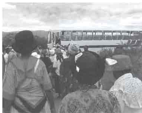
Figure 6. Farmers from other villages were invited to share in the knowledge acquired during MSE.

During the mid-season evaluation, farmers would share successes and challenges that they experienced in trying out different options to solve their technical problems in the field (Figure 6). For the first time, farmers shared with others how they managed to organise themselves into umbrella organisations to help them access inputs. These mid-season evaluations were so successful that they have turned into annual events organised by farmers.