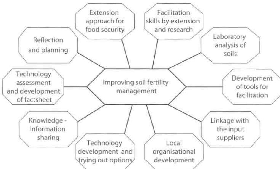
Figure 7. Strategy for soil fertility management in smallholder farming systems.

Subsequent reflection by the research team revealed that both the farmers and officers had gone through a process of joint learning during the development of the soil fertility management process. Table 8 documents changes that occurred among the farmers and officers at different stages of the soil fertility management process.