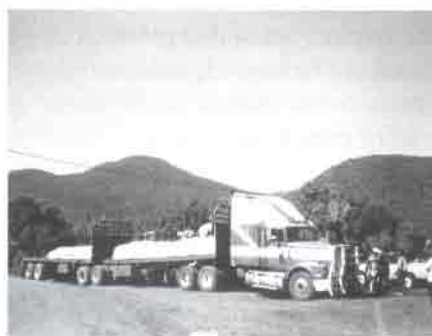
Figure 4. Lime delivered by the input supplier to the village.