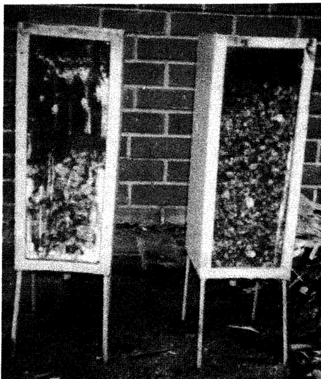
Figure 1: Simulation of two soil profiles, one of which is eroded and the other which has been well protected.

Two simulated soil profiles contained in glass boxes with an outlet at the bottom are compared (Fig. 1). One profile is eroded and as a result has shallow topsoil. The other profile simulates well managed, non-eroded soil. An equal amount of water is poured into the two soil columns. The shallow, eroded soil has a lower water retention capacity and half of the water immediately flows away. The non-eroded profile is able to hold most of the water. Having observed this simple experiment, the farmers' learning process is facilitated by questions such as "What happened?", "Why did it happen?", "What effect has this on plants growing on these soils?", "Have you seen this happen in your fields?", and "What is the effect in your field and has this changed over the last few decades?". In that way farmers discover and analyse biophysical principles and relate them to their situation. The analysis reveals the link between human-induced drought and soil erosion.