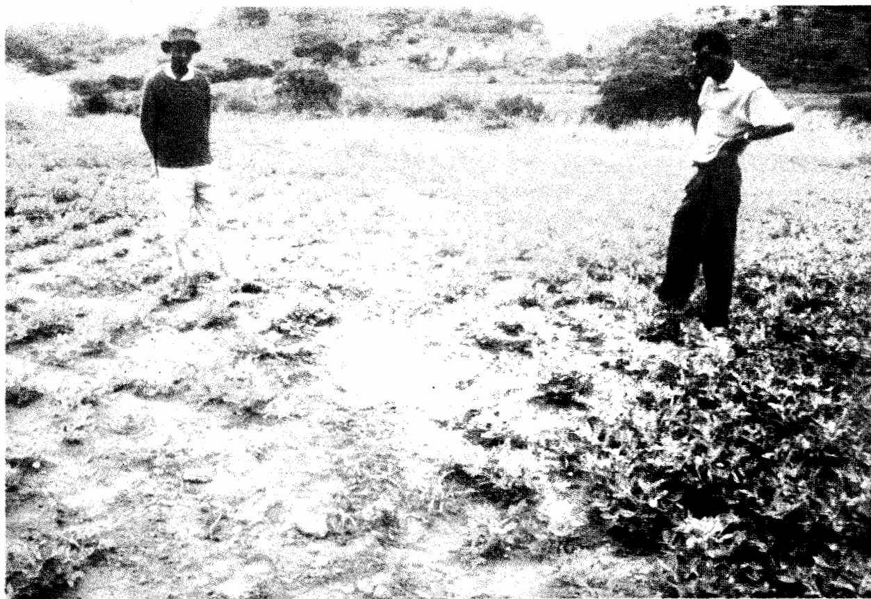
Figure 3: The simple paired experiment in a farmers field.

Think tanks, where numerous technical options are shown in the field, are used to expose representatives selected by communities to the technical options available in land husbandry. The sources of these innovations are creative farmers, training centres and research stations. Visits to 'think tanks' are organised and farmers are encouraged to identify 'think tanks' and organise visits to these sites. Feedback to the community after such excursions is an extremely important step in encouraging